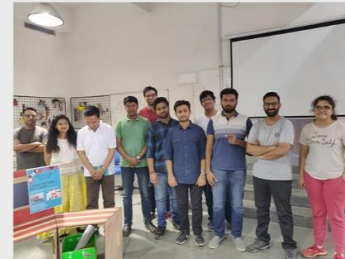
3D Printing Workshop