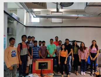
Adobe Photoshop Workshop