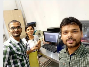
PCB Fabrication Workshop

To promote a fun filled learning experience, we conduct a lot of workshops. It helps all to bring out the CREATIVE side of their personality.