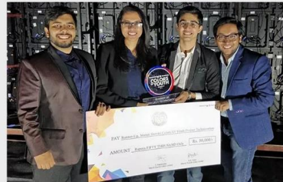
"A Depression scanning system"